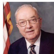
Sen. Jesse Helms